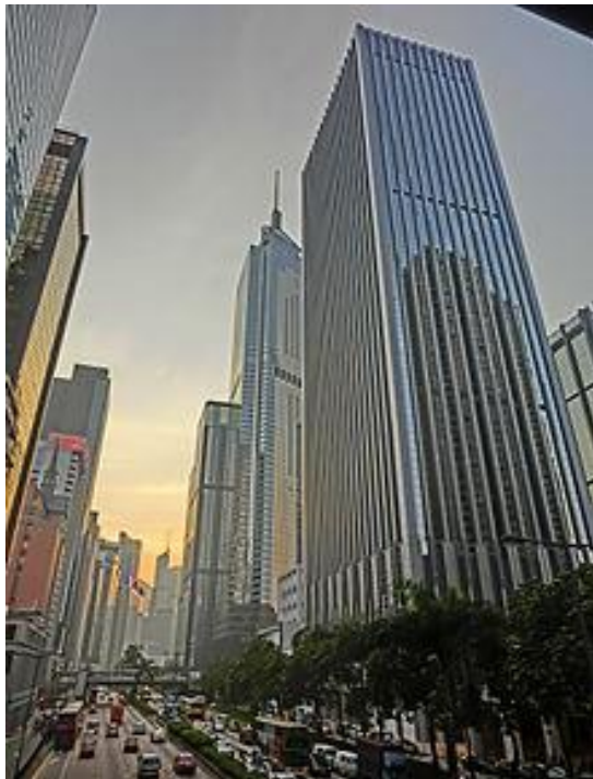
Central Street, Hong Kong