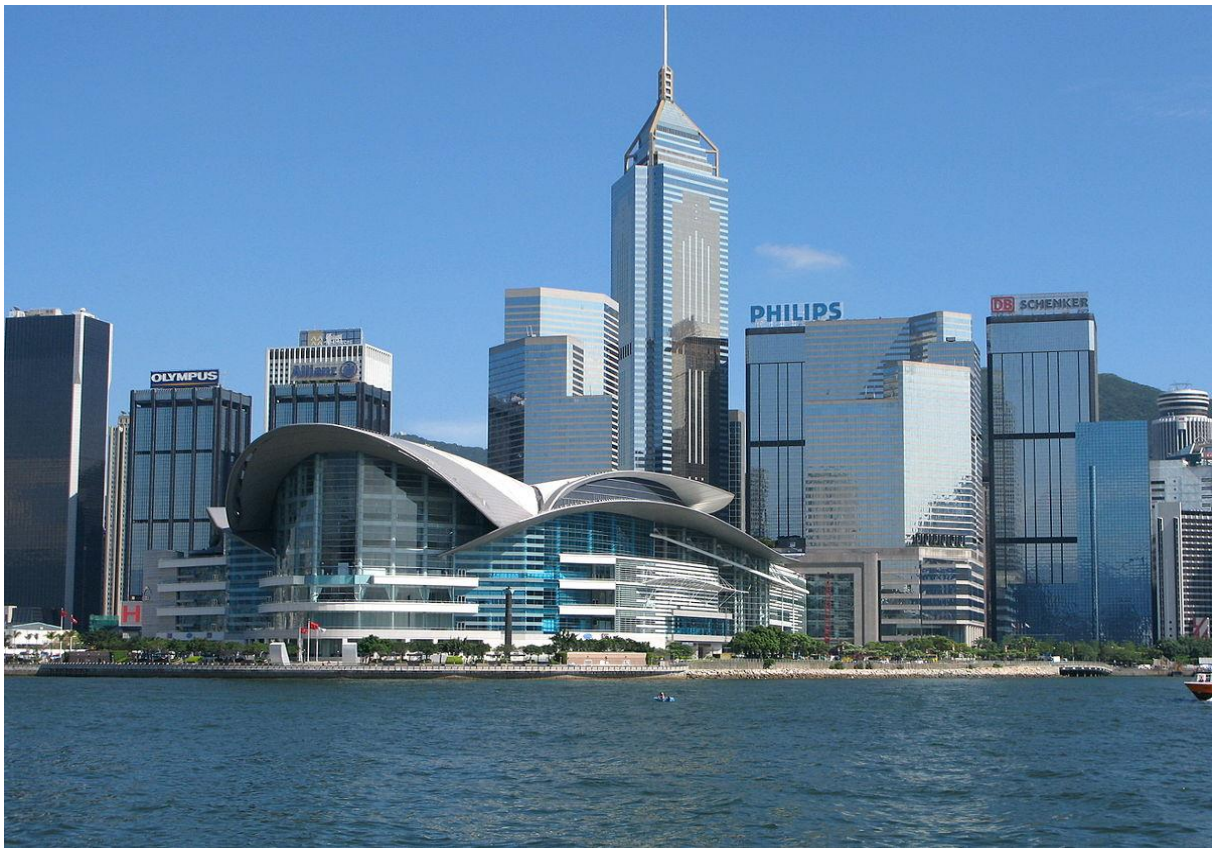
Hong Kong Island

Served as Executive Officer at the Japan Branch of Prudential Securities, part of the Prudential Financial Group (currently the Investment Banking Division of Capital Partners Securities Co., Ltd.), where he was involved in numerous advisory services, fundraising, and M&A operations.