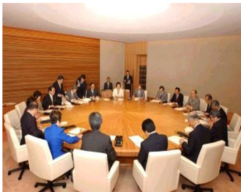
◆ Scene of Discussions and Study Sessions with Institutional Investors