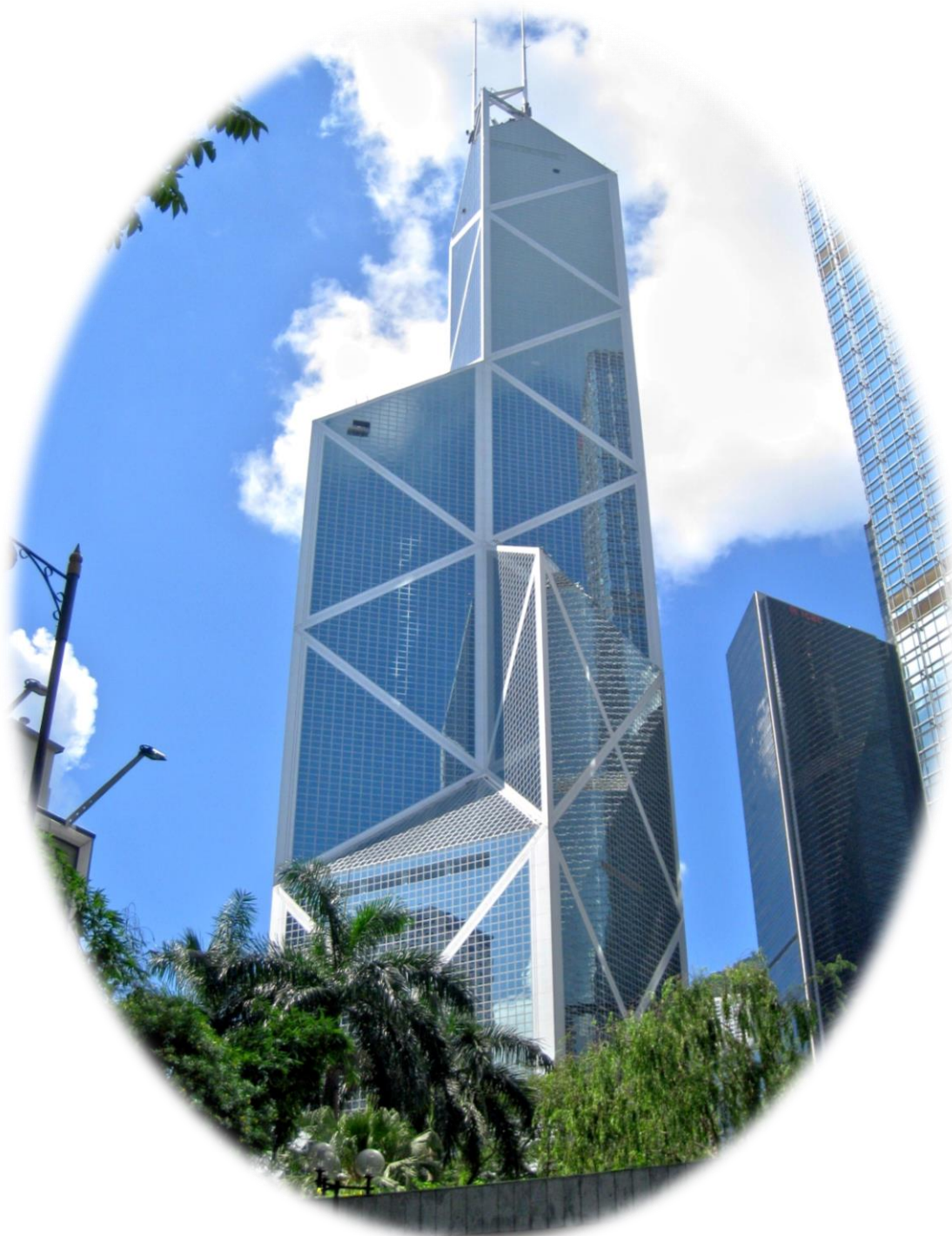
◆ Hong Kong Bank of China Tower

ASIAN VENTURE INVESTMENT SUPPORT SOCIETY