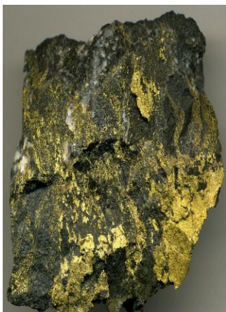
◆ Ore (from Raw Material to Refined Gold)

※ Urban Mining Recycling and Smelting Project / Subject to Our Investment